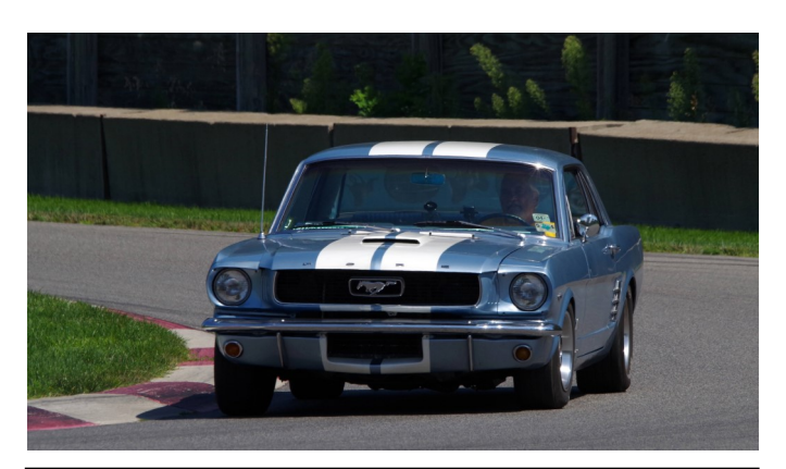
Gibson Nichols during parade lap at Paddock Curve