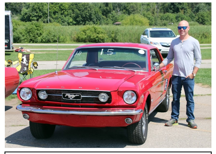
Nick Sears' 1965 Mustang Coupe