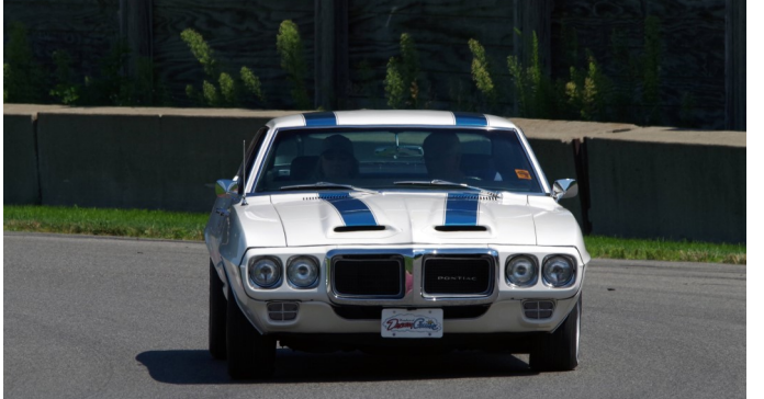
Kent Woiak during parade lap at Paddock Curve