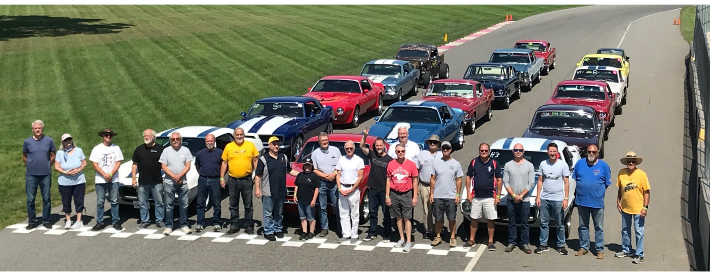
All the Michigan Fantasy Trans-Am participants in front of their cars at Start-Finish