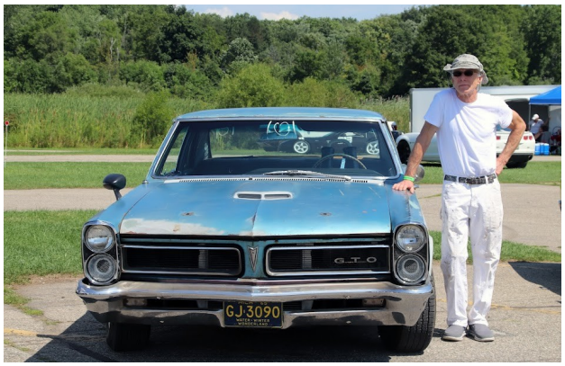
A "walk in" 1965 GTO that paid homage to Herb Adams legendary Grey Ghost