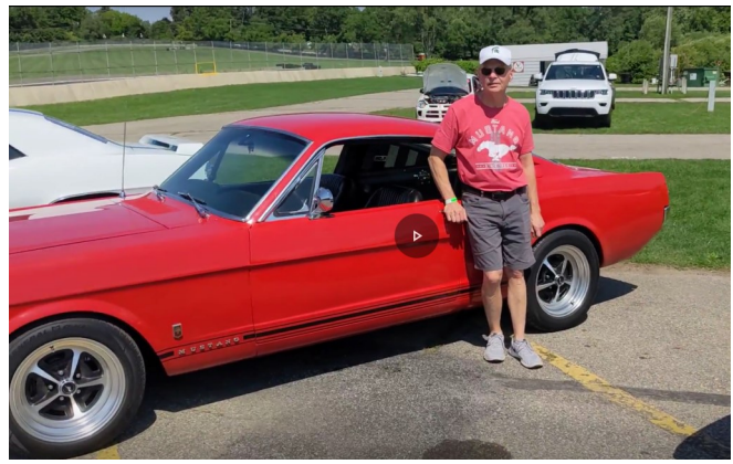
Dennis Rybicki's 1965 Mustang 2+2