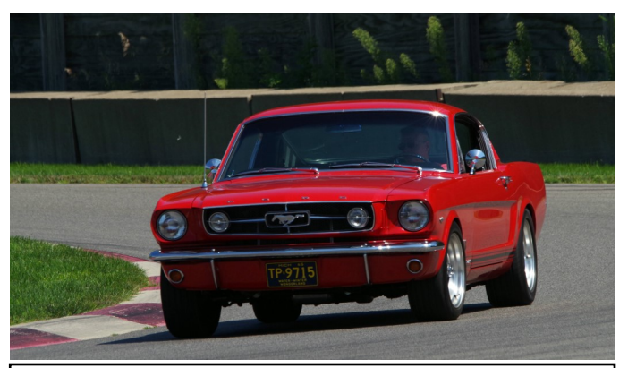
Dennis Rybicki during parade lap at Paddock Curve