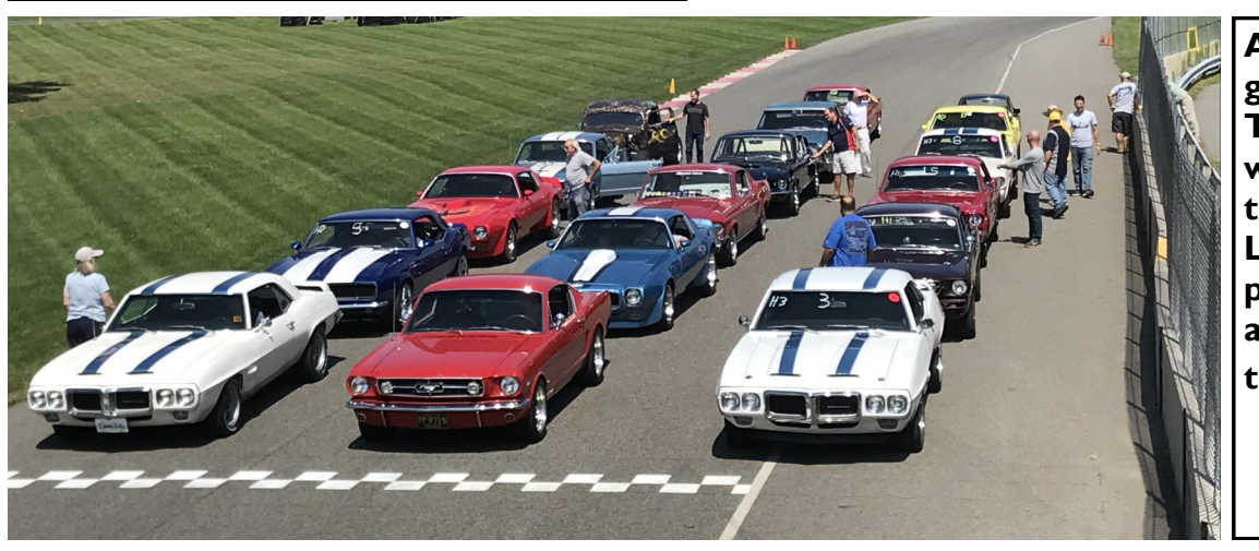
All the Michigan Fantasy Trans-Am Cars were parked at the Start-Finish Line, after the parade laps around the track